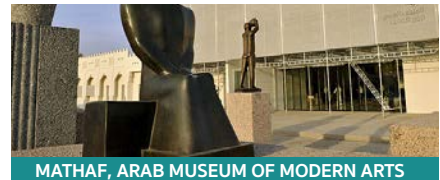
MATHAF, ARAB MUSEUM OF MODERN ARTS