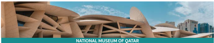
NATIONAL MUSEUM OF QATAR