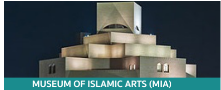
MUSEUM OF ISLAMIC ARTS (MIA)