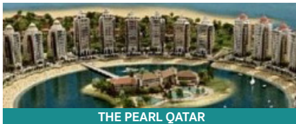
THE PEARL QATAR